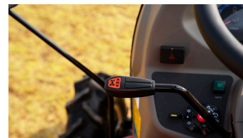
6. Shuttle transmission