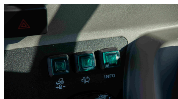
3. Cruise control