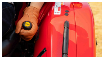
2. Auto PTO lever