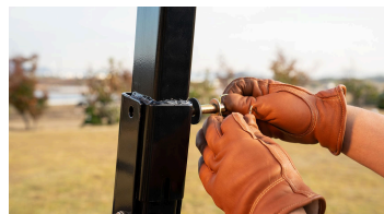
4. Foldable ROPS